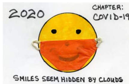
"Postcard from the Front"